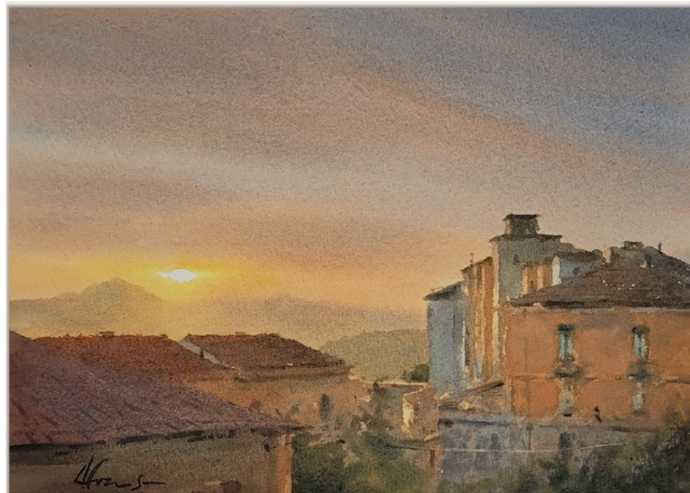
Saharan Dust Sunset